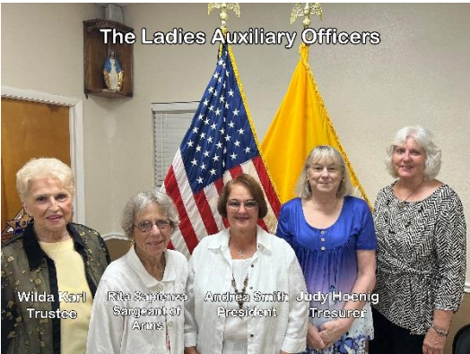
The Ladies Auxiliary Officers